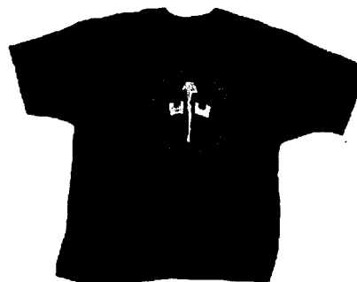
L, XL, XXL - $12